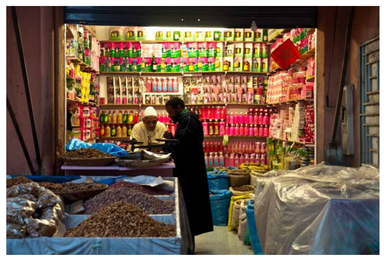
> Electric lighting supports evening commerce in Morocco.