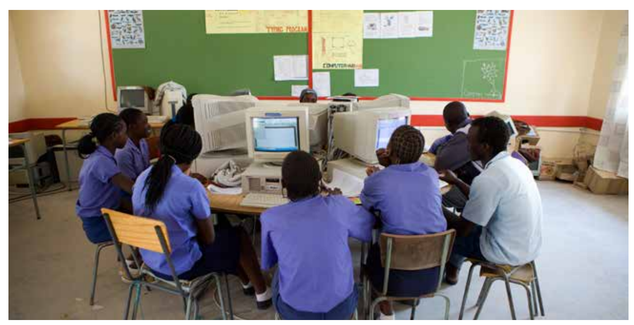
> Electricity use in classroom to support use of information technology in Namibia.

objective globally will depend critically on the progress that can be made in these countries. A third group of 20 high-income and emerging economies accounts for four-fifths of global energy consumption. Thus, the achievement of the global SE4ALL objectives for renewable energy and energy efficiency will not be possible without major progress in these high-impact countries.