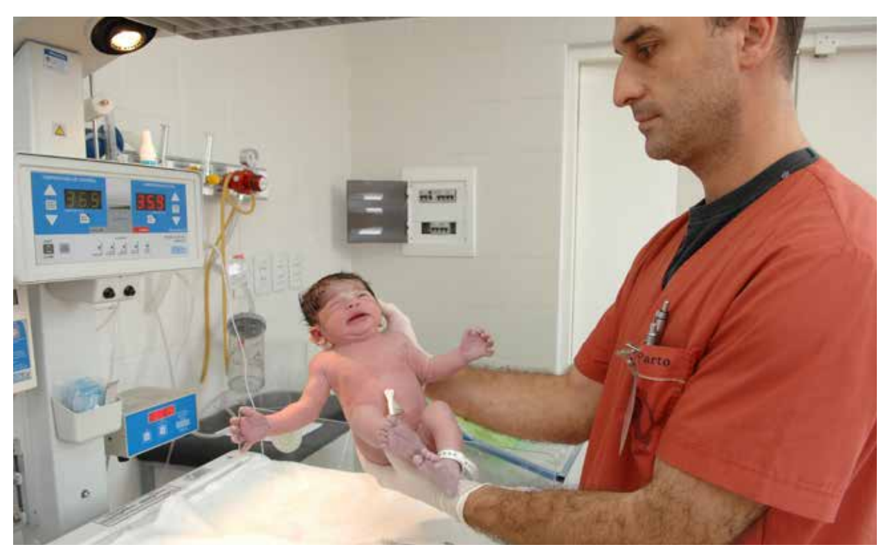
> Electricity powers critical health equipment to support delivery of newborn baby in Argentina.