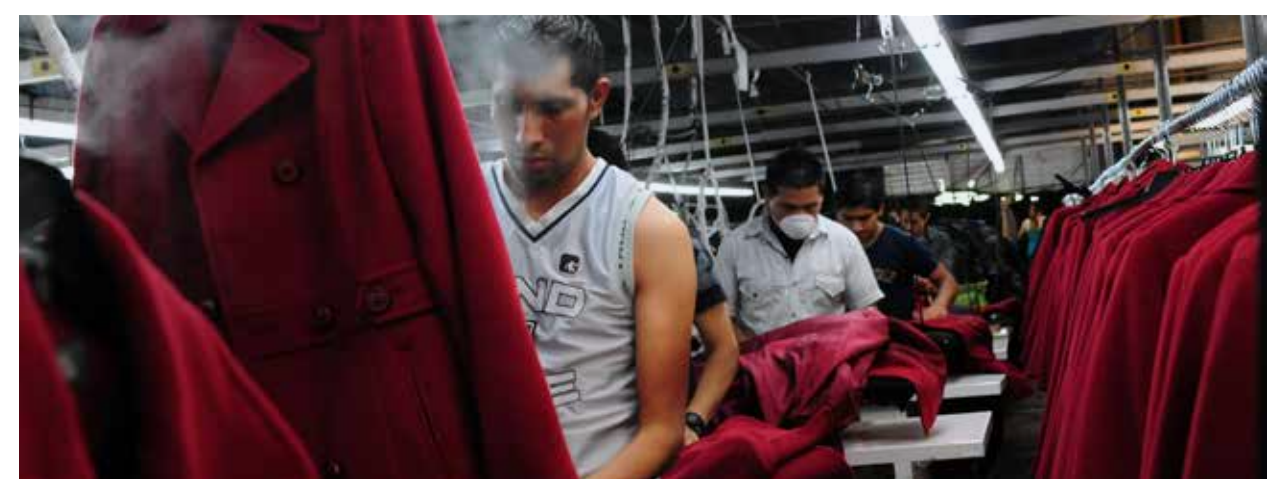
> Electricity powers a garment factory in Guatemala.